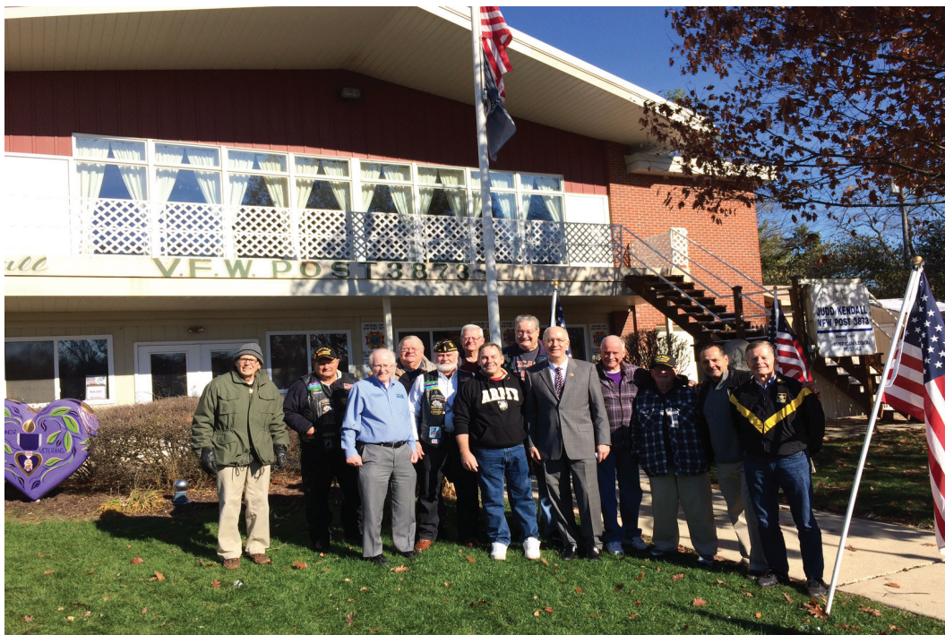
Congressman Bill Foster paid a visit to the Veterans to thank them for their service.