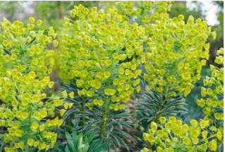
Euphorbia Diamond Dust