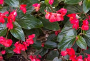
Begonia Green Leaf (Shade)