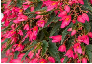
Begonia Red Foliage (Shade)