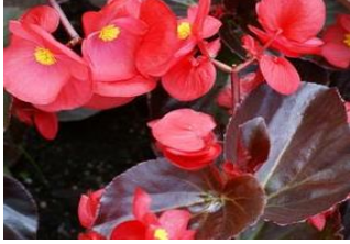
Begonia Tuberous (shade)