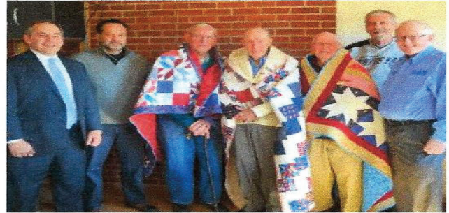
Veterans honor veterans.