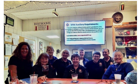
During a visit from the District President, several Auxiliary members gather socially at the Canteen.

Don't forget the 1st Tuesday of the Month Auxiliary Social Hour starting at 5:00 pm in the Canteen. Stop by and chat with friends (or make new ones). We welcome new members too.