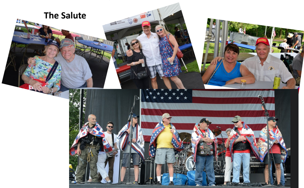
Some of the Quilts of Valor Recipients

Have You Heard About the VFW’s Partners in Patriotism? – Would you like to support the VFW’s life-changing programs for veterans, service members and their families without receiving all of the unwanted mail? The VFW has developed an option that lets you support VFW programs on a monthly, quarterly, or yearly basis, as well as reduce expenses and eliminate National’s mailed solicitations for donations. It is called Partners in Patriotism. As a member of Partners in Patriotism, you choose a set dollar amount for your donation (minimum amount of $10) that is either charged to your credit card or set up as an Electronic Funds Transfer (EFT) from your bank account. If you are interested in joining Partners in Patriotism, you may contact the VFW Development Department Donor Services at 816-756-3390, ext. 6318, or email partners@vfw.org with “Partners in Patriotism Application” in the subject line.