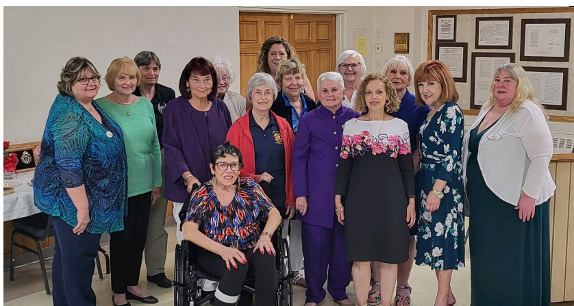
2022-2023 Auxiliary Board Installation Dinner, attended by Department of Illinois President and Chief of Staff, and District 19 President.